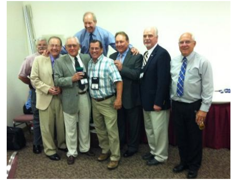
Rat Pack 2011