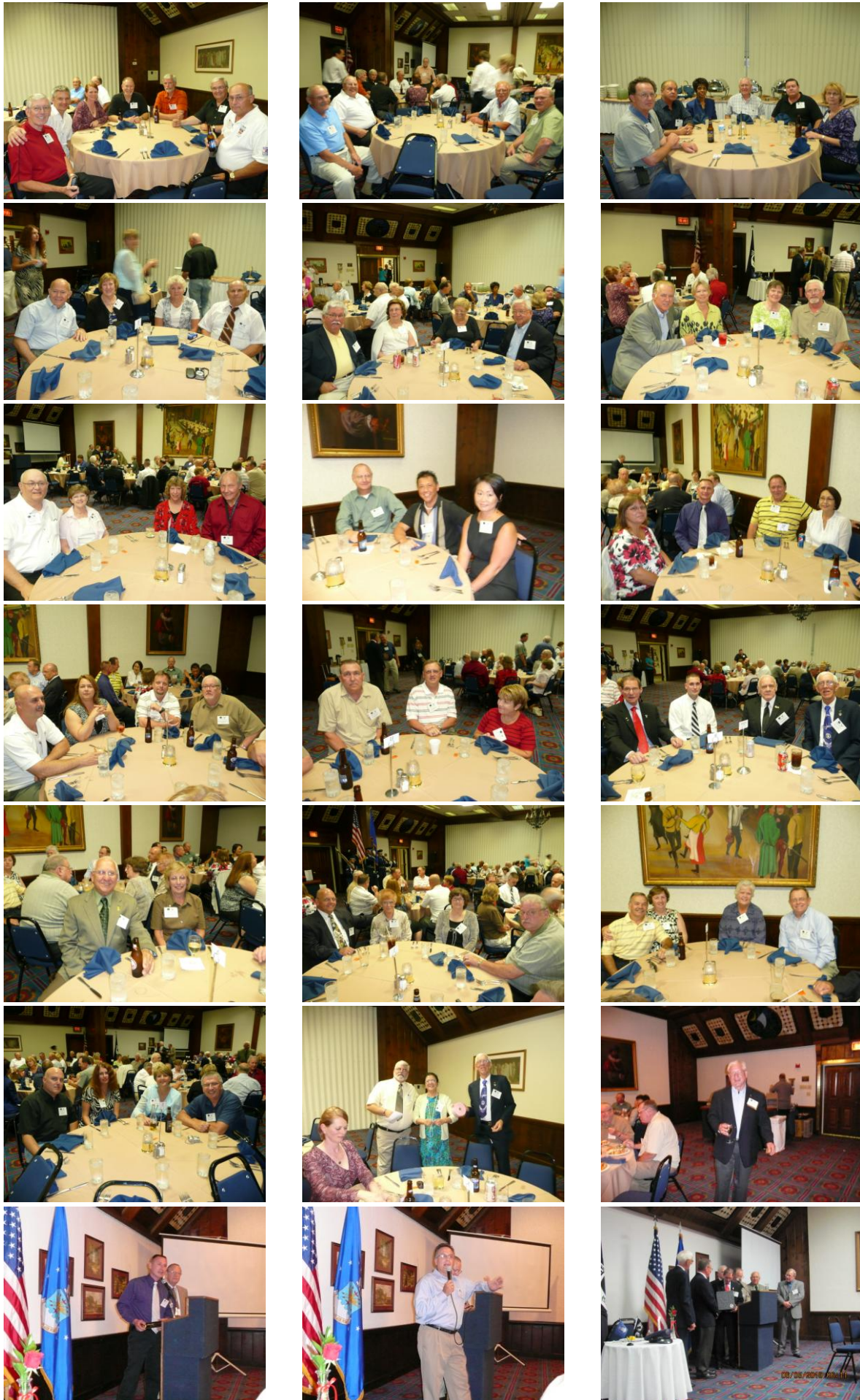
We had a buffet dinner, a cash bar, awards and a 50/50 raffle. There were three guest speakers.